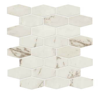
CT30 Palazzo White