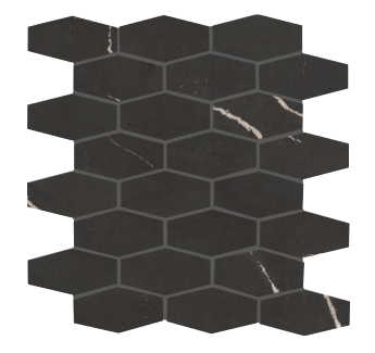
CT34 Centurio Black