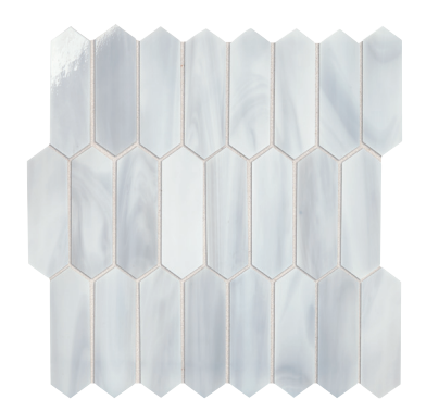
CE20 Pearl (1)