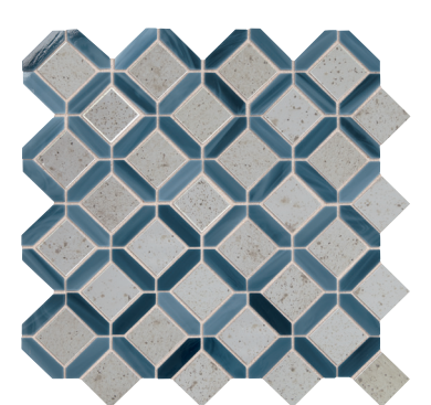
CE22 Sapphire (1)