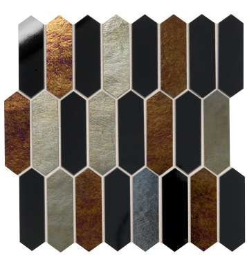
CE23 Onyx (2)