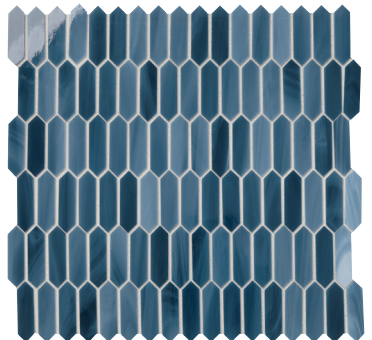
CE22 Sapphire (1)