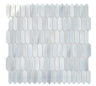
CE20 Pearl (1)