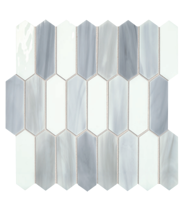
CE21 Sterling (1)