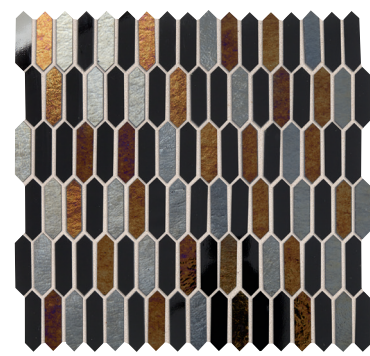
CE23 Onyx (2)