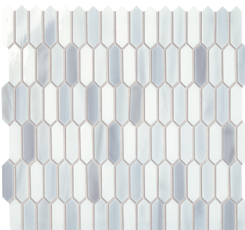
CE21 Sterling (1)