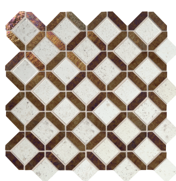
CE23 Onyx (2)