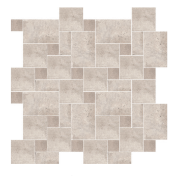
CV41 Natural | Pattern 1