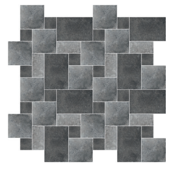
CV43 Carbon | Pattern 4

PATTERN 4 - SQUARE FEET 33.33% of 24 x 36 44.44% of 24 x 24 11.11% of 12 x 24 11.11% of 12 x 12