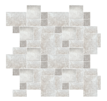
CV42 Greige | Pattern 2