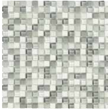
UL8X Pearl 12"x12" Square Mosaic