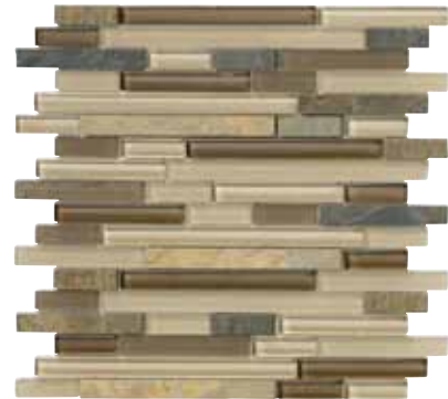
UL93 Terracotta 12"x12" Strip Mosaic