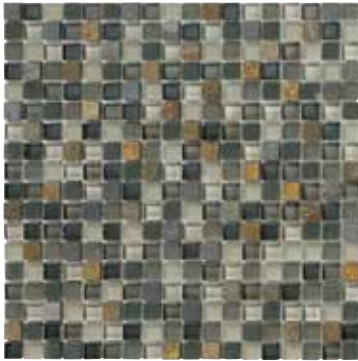
UL8V Slate 12"x12" Square Mosaic