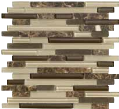
UL8Z Espresso 12"x12" Strip Mosaic