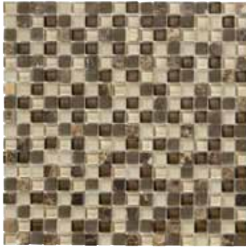
UL8U Espresso 12"x12" Square Mosaic