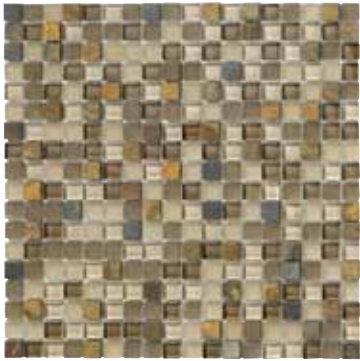
UL8W Terracotta 12"x12" Square Mosaic