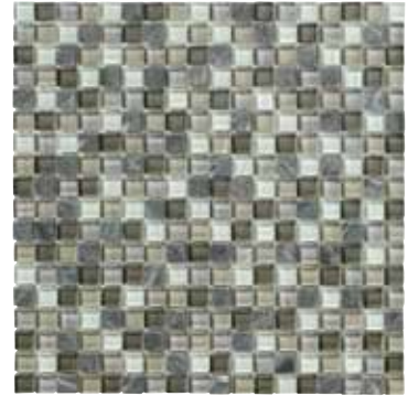
UL8Y Pewter 12"x12" Square Mosaic