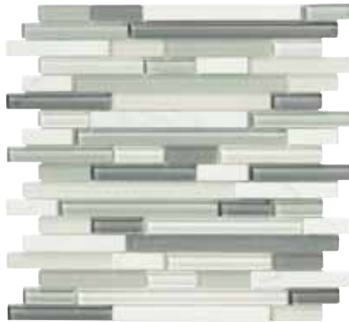
UL94 Pearl 12"x12" Strip Mosaic