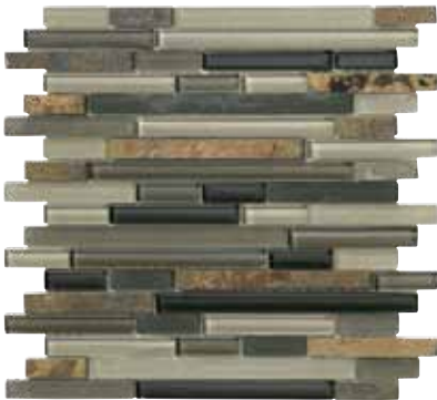
UL92 Slate 12"x12" Strip Mosaic