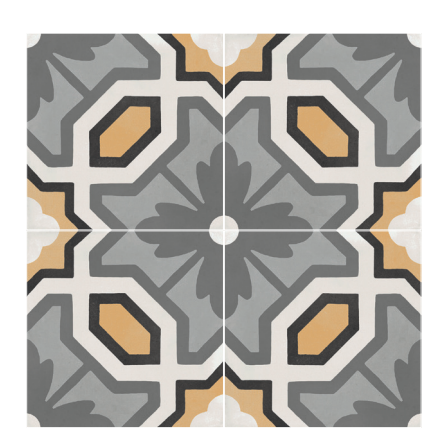
M1L5 Honeycomb (4 Pieces) Mustard/Midnight/Chalk/Shadow Blend