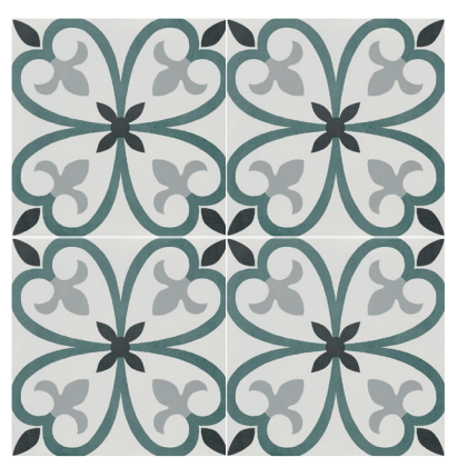
M1L4 Clover (4 Pieces) Midnight/Chalk/Indigo Blend