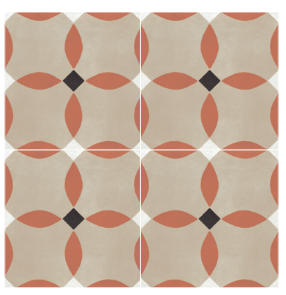
M1L7 Monarch (4 Pieces) Chalk/Midnight/Tangerine Blend