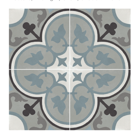
M1L6 Lily (4 Pieces) Chalk/Denim/Midnight/Smoke/Shadow Blend