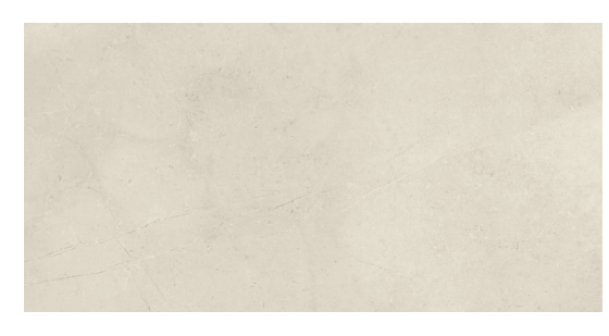
MF01 Peak White MF02 Overland Beige MF03 Canyon Taupe MF04 Headland Fog MF05 Smoky Ridge MF06 Mesa Point