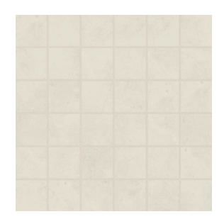
MF01 Peak White MF02 Overland Beige MF03 Canyon Taupe MF04 Headland Fog MF05 Smoky Ridge MF06 Mesa Point