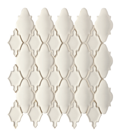
SE26 Off White