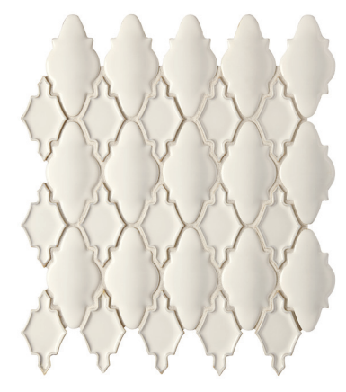
SE26 Off White