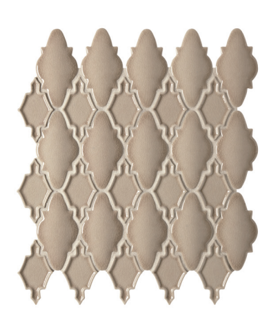
SE28 Dark Tan