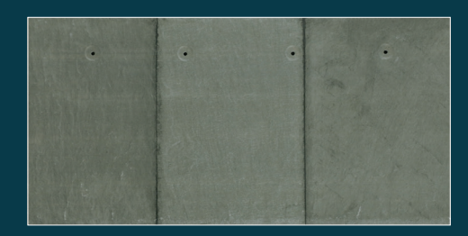
CELTIC SLATE PR47