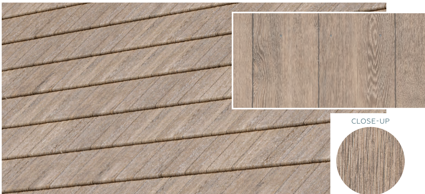
NORDIC TIMBER PR40