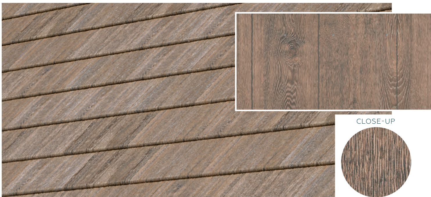
MYSTIC TIMBER PR41